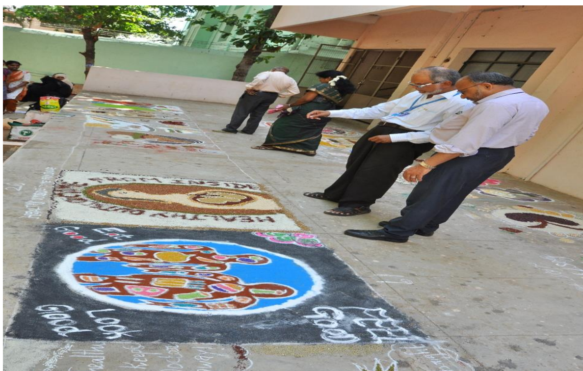
Grain carpet competition