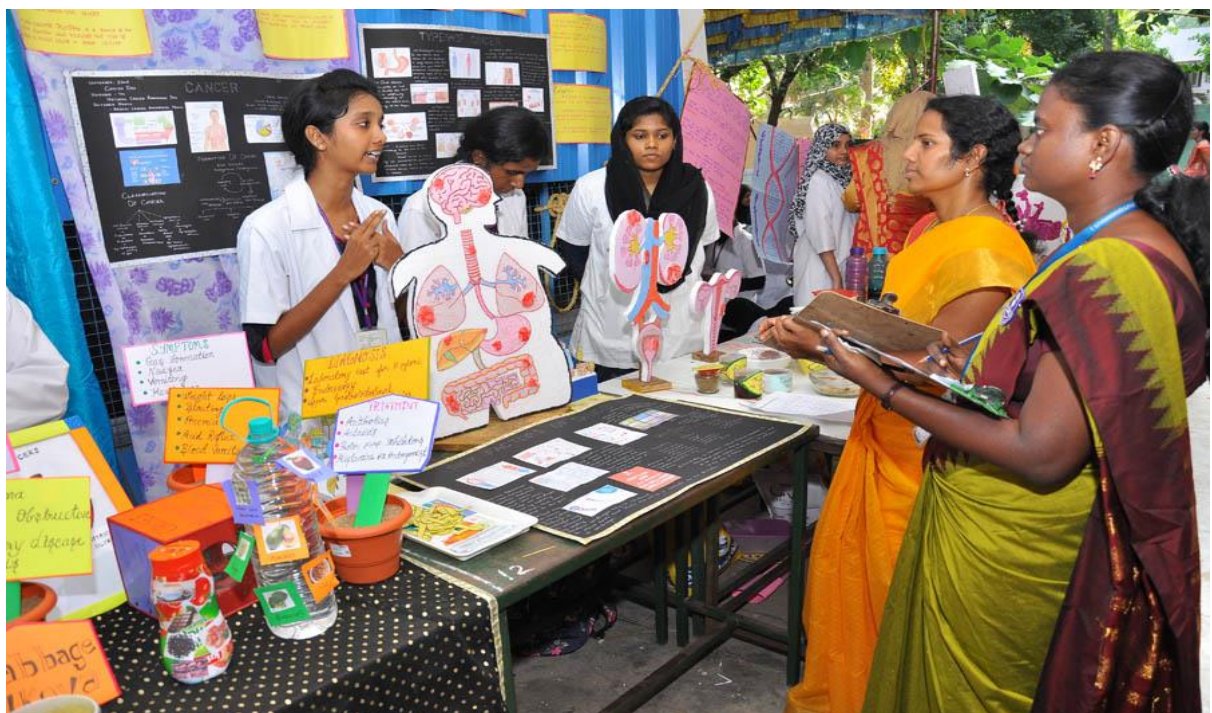
Students explaining about their models to our judges