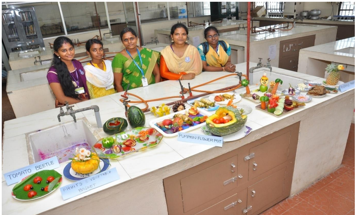
Fruits and vegetable carving competition